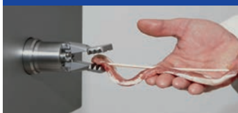
Wraps skewers automatically

For the professional production of bacon grill sticks with neck meat and other ideas . The wrap system guarantees a reliable hold of the meat on the skewer during seasoning, weighing, packaging and barbecuing.