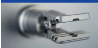
Modern skewer wrapping system